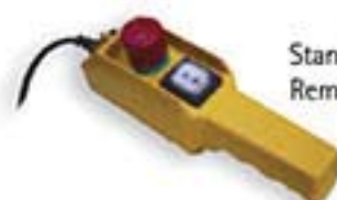
Standard: Remote Control