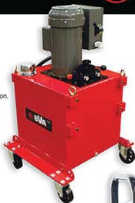
PE3015 Custom Made

Electrical Pumps will be delivered without hydraulic oil inside.